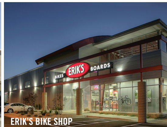
ERIK'S BIKE SHOP