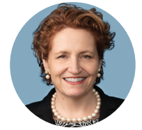
by Sonnie Elliot, FAEGRE DRINKER

MINNESOTA SAW RECORD VOTER TURNOUT FOR THE NOVEMBER 3, 2020 STATE GENERAL ELECTION. An estimated 3,290,000 Minnesotans voted in the election; of these approximately 1,846,668 were absentee ballots. Of Minnesota’s eligible voters, 79.9% participated in the general election and that makes us #1 in the nation for voter turnout. The national average was 66.4%.