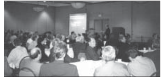
Above: 165 industry professionals attended the Retail Tournament of Champions.