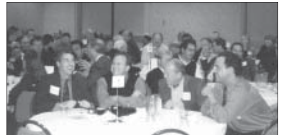
Below: Each table worked as a team to answer questions regarding retail real estate.

developments "spurred on" by the "strong residential growth" in the Twin Cities and outlying areas. New developments opened in 2003 included Excelsior & Grand in St. Louis Park, Arbor Lakes in Maple Grove, and Southwest Station in Eden Prairie. Cub Foods, Super Target, and Wal-Mart continue to be the strong anchors for shopping centers with some new retailers coming on the scene including CVS Pharmacy, Roundy's, IKEA and Lowe's. "Fast Casual" had been the new buzzword on the restaurant scene – some of these restaurants include Panera Bread, Noodles and Company, Baja Fresh and many more.