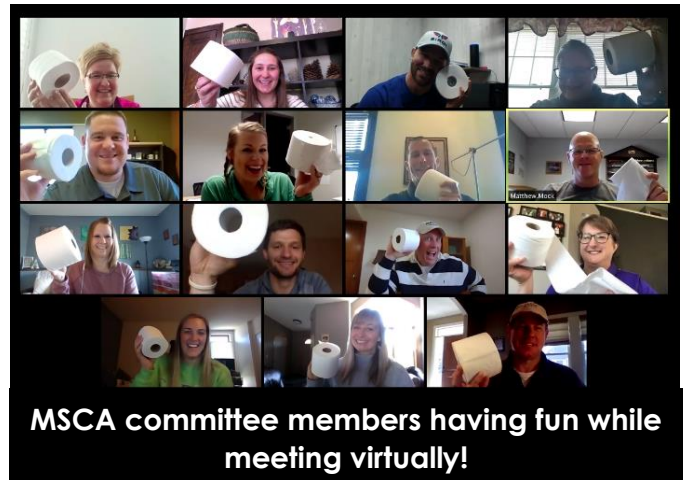
MSCA committee members having fun while meeting virtually!